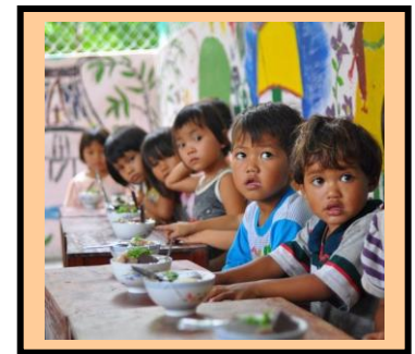
Vinh Son 6

Our annual appeal is right around the corner. There is still so much to do, and that's why we'll be counting on you!