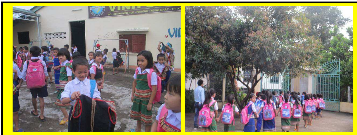
Traditional clothing is worn on the 1 st day, and the backpacks are full of supplies. The children lined up for the walk to school under the watchful eye of the caregivers.

At 7.30 AM, all the students gathered on the school yard in front on two sides of the platform and of the flag pole. They have to cue and stand on the ranks of their own grades and they keep silence well and they are very serious in wearing their nice school uniforms including: white shirts, blue trousers, white shoes, new school color jackets and a white garrison cap on their heads. Especially this morning, there is a school team of clarinets and small drums. Every student looks very proud and happy to hold the strings of the colorful balloons to celebrate their beginning of New School Year. All the people at the school are preparing the clothes for the celebration of national Flag Salute while singing National anthem according the rhythm of the clarinets and of the small drums.