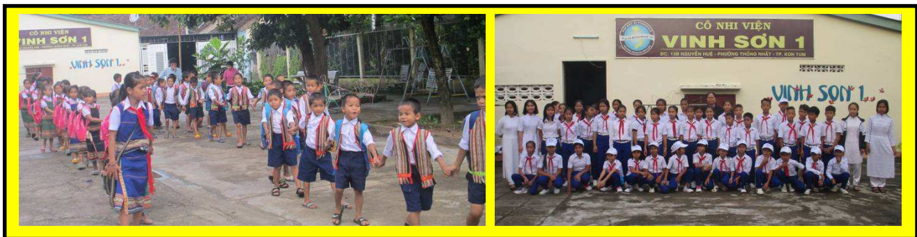
Let's hear it for the kids of Vinh Son 1. A similar scene would also take place at the other Vinh Son locations

All the Sisters and all the ethnic minority orphans, together with the volunteers of the six Vinh Son Orphanages, always carved in their minds and in their spirit all the gratitude to FVSO Board members, benefactors, sponsors and donors who have sacrificed their time and many funds to improve the poor ethnic minority orphans in Kontum here. They promised in their heart that they will study well at school to pay back their gratitude to all the donors of FVSO.