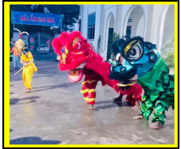
The Lion Dance at Sao Mai

The children in the orphanages gathered together to celebrate as a family with prayers, singing, dancing and of course the traditional Lion Dance. For the children, the most important event is the giving of Moon Cakes, sweet little delicacy that they can enjoy with their friends. This year FVSO, in partnership with VietDreams, made sure each child in VSO and Sao Mai had a moon cake to enjoy.