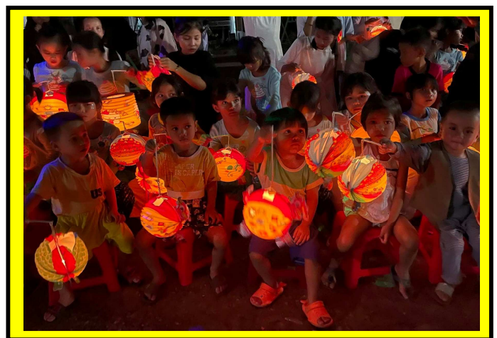
VietDreams and FVSO shared the expenses for this year's celebration