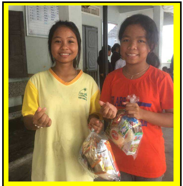
The gifts may have been small but greatly appreciated

In general, Children's Day is the occasion of promoting the bond between parents and kids as well as the connection among children.