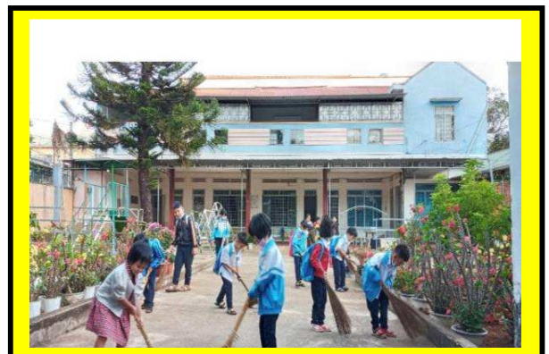
Gardening requires a lot of effort, but the kids take pride in what they accomplish

The children now have a spacious, clean roof and a campus for them to enjoy; grateful for the kindness of so many hearts towards the orphans. From now on, the children can run, jump and play freely, and have more small gardens to grow crops. They have more fun and learn to take care of plants. It is a pleasure to join hands to make the home more beautiful.