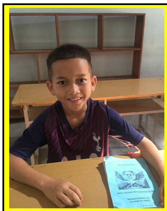
With education comes hope for a productive and satisfying life. If you can, please help us fulfill that dream.

We are proud of all our students, and FVSO supporters have our deepest appreciation. If you would like to help these students follow their dreams, please note “Education” somewhere on your contribution check. We’ll make sure it gets to the right people.