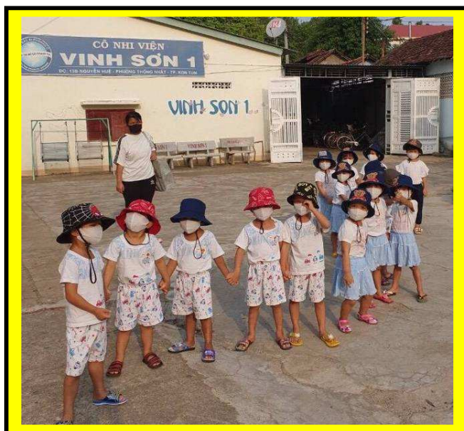
Above: "the hat brigade of Vinh Son" boys and girls on their way to kindergarten

On the morning of September 5th, 2020, there were 729 children from all six VSO locations, each wearing clean school uniforms. They happily went to school to attend the opening ceremony of the new school year: The young girls of the senior high school were wearing their Vietnamese traditional white "AODAI" as their school uniform. The boys of senior high school age and all the students of the junior high school also wore their new school uniforms, a white shirt and blue trousers with a red scarf around their necks. They had on white sport shoes with school badges on their white shirts. For the ethnic minority students of the primary school, they were dressed in their ethnic traditional uniforms with many different vibrant colors, looking very nice. Most of the children are very happy and eager to start their new school year. They were very glad to meet their old classmates and teachers, and they quickly made friends with the newcomers in their classes.