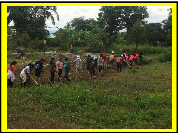
TOP: work crew heads out to the fields BELOW: catching up on English lessons MIDDLE: needs no explanation