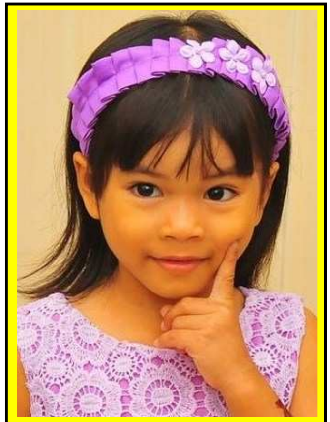
The question on her mind is "how can I thank everyone who gives me life?"