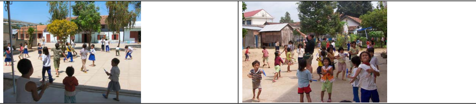
Figure 5 & 6 Children playing with the Propeller toys donated by Aero-Motion